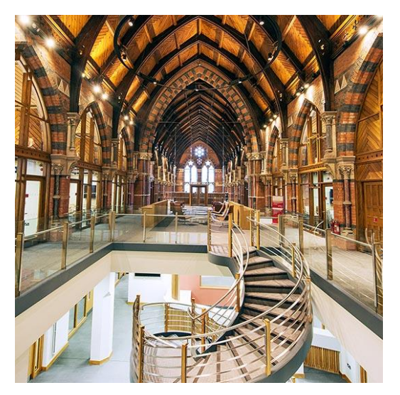
Figure 23. Image of the Lynn Building.

In 2018 the Lynn Building celebrated its 150-year anniversary. A number of events took place to celebrate this anniversary. Further information on the history of the building and the 150-year celebrations are available on the Queen's <u>website</u>.