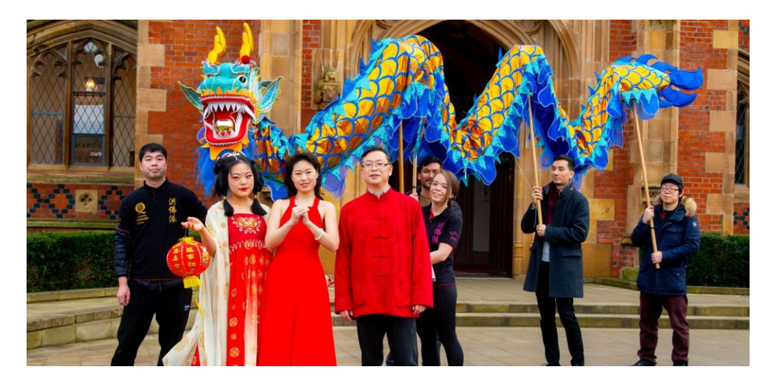
Figure 30. Chinese New Year 2022.

7.2.11 Lennoxvale Tree Nursery and the Million Trees for Belfast Initiative In November 2019, Queen's staff and student volunteers joined local residents, San Souci Resident Association and The Conservation Volunteers, to celebrate the <u>opening of a new tree</u> <u>nursery</u> at Lennoxvale.