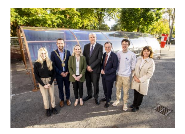
Figure 3. Launch of new all-inclusive, cycle parking infrastructure in October, 2024.

In partnership with Belfast City Council and Department of Infrastructure the University has installed a new, all-inclusive, cycle parking infrastructure at Queen's University Belfast main car park. It can hold 55 bikes and contains a battery charging cabinet for e-bikes.