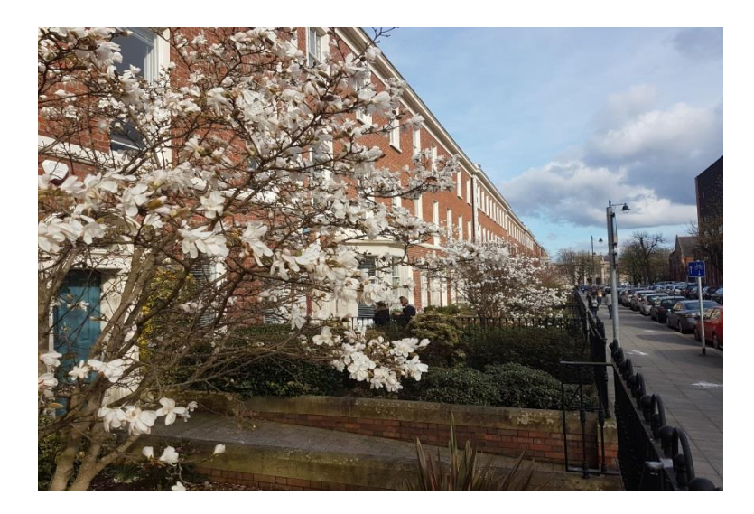
Figure 9. The Lanyon Main Site contains a number of Magnolia Trees.