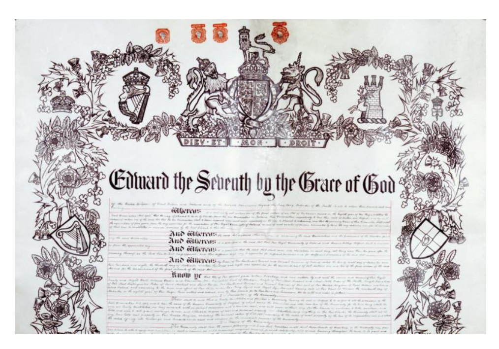
Figure 18. Queen's University Belfast Royal Charter.

Queen's is the ninth oldest University in the UK, founded by Royal Charter in 1845 (Figure 18). Founded by Queen Victoria, the Queen's University in Ireland, was designed to be a nondenominational alternative to Trinity College Dublin which was controlled by the Anglican Church.