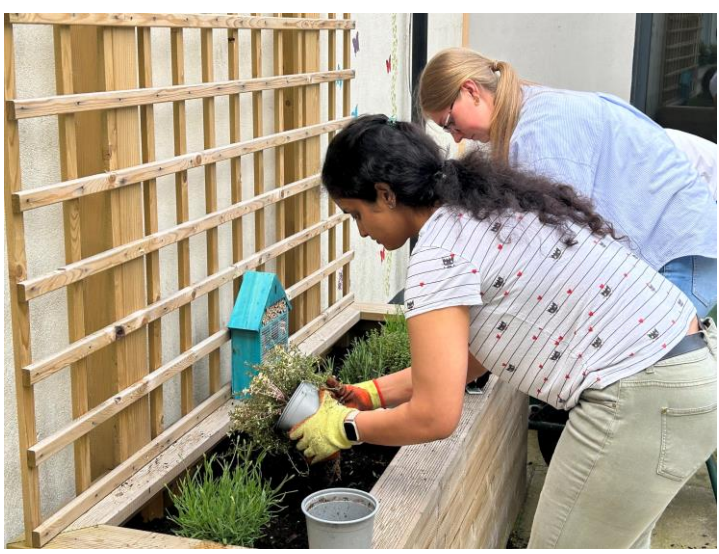
Figure 14 and 15. Images of 'Pocket of Green Spaces' project along University Square.