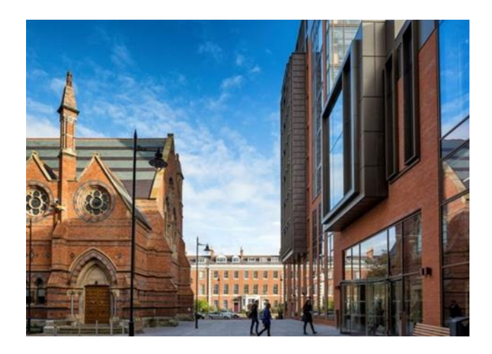
Figure 26. Image of the Main Site Tower.

The building integrates impressively with the adjacent Gothic and Tudor style library and music school.