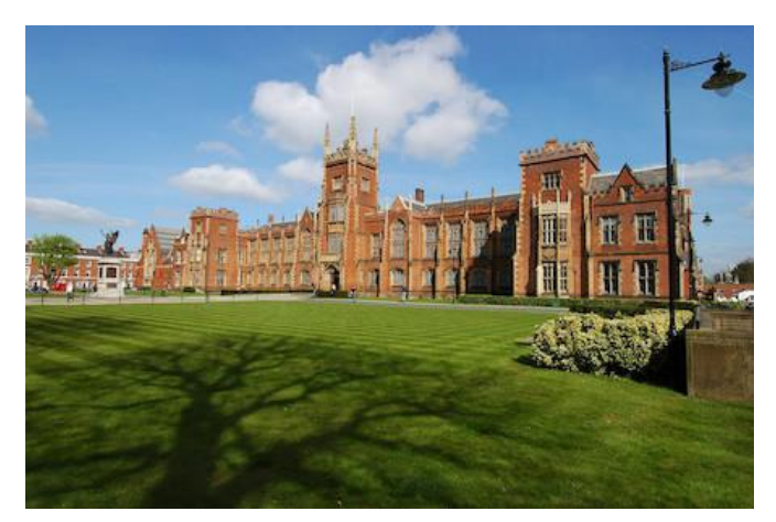
Figure 2. The Lanyon Main Site is open to the public seven days a week.

The Lanyon Main Site (incorporating University Square) consists of several well-maintained open green spaces comprising of lawns, flower beds and borders, in an otherwise densely populated urban area. A considerable proportion of the site is pedestrianised. The green space is set against the impressive Lanyon building, a Grade A listed building maintained and preserved to the highest standards. The Lanyon Main Site has been designed to ensure the site is both visually striking and welcoming. A number of buildings are located within the site and are used for teaching, office space, research, meetings and functions. Several of the buildings that are located on the Lanyon Main Site are of significant architectural merit.