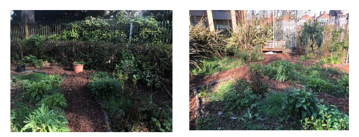
Figure 12 and 13. Image of the McClay Library Sound Garden.

by a team of staff located within the library in conjunction with the Gardening team who offer technical and labour support.