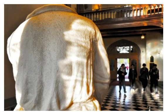
Figure 22. Image of the Black and White Hall.

The Black and White Hall, can be found through the main doors of the Lanyon Building. The central statue of Galileo, by Pio Fedi, was installed in the hall in 2001 as part of the restoration of the adjacent Great Hall.