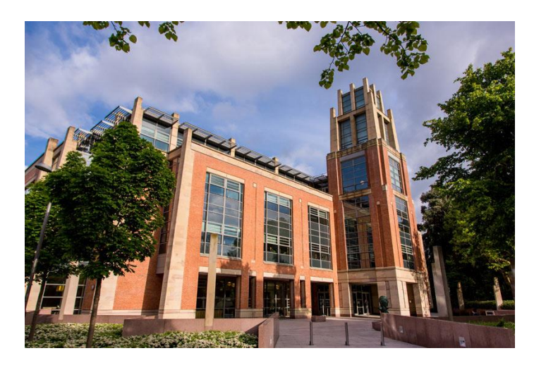
Figure 25. Image of the McClay Library

The building has achieved a number of awards including the Royal Institution of Chartered Surveyors Award for Sustainability in 2010.