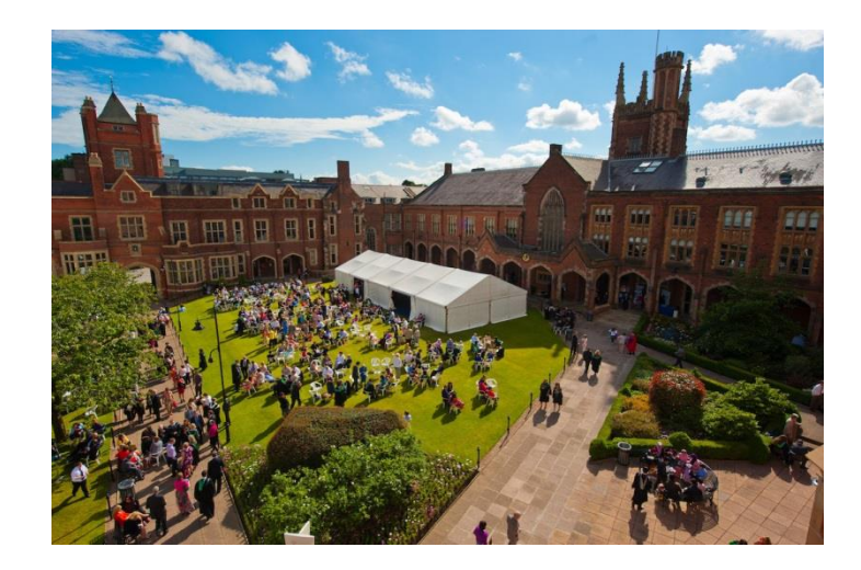
Figure 30. Summer Graduation in the Quadrangle.