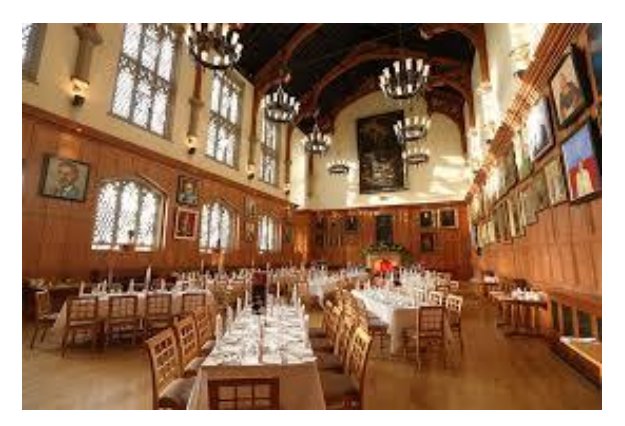
Figure 21. Image of the Great Hall

The most dramatic space in the University, the Great Hall houses portraits of many inspiring and influential Queen's people. The Great Hall was inspired by the medieval great halls found in colleges in Cambridge and Oxford. Many of the intricate features originally planned for the hall were cut out due to budget constraints and were added during an extensive £2.5m renovation in 2002, which restored it to Lanyon's original plans. Further renovations in 2018/19 have further enhance this space.