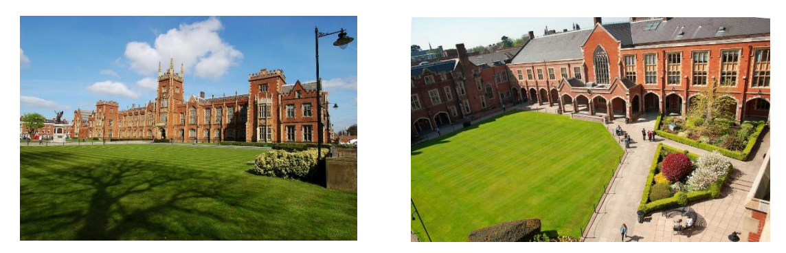
Figure 10. Image of the Lawns at the Lanyon Main Site.

A low chain runs around the lawns to restrict access and prevent degradation and impact from trampling. However, these chains are removed for key events such as Summer and Winter Graduation and exhibitions such as the annual careers fair. During these events marquees are often located on the front lawn and in the Quadrangle. During the summer month's staff and students are free to use the lawn for classes, study or leisure.