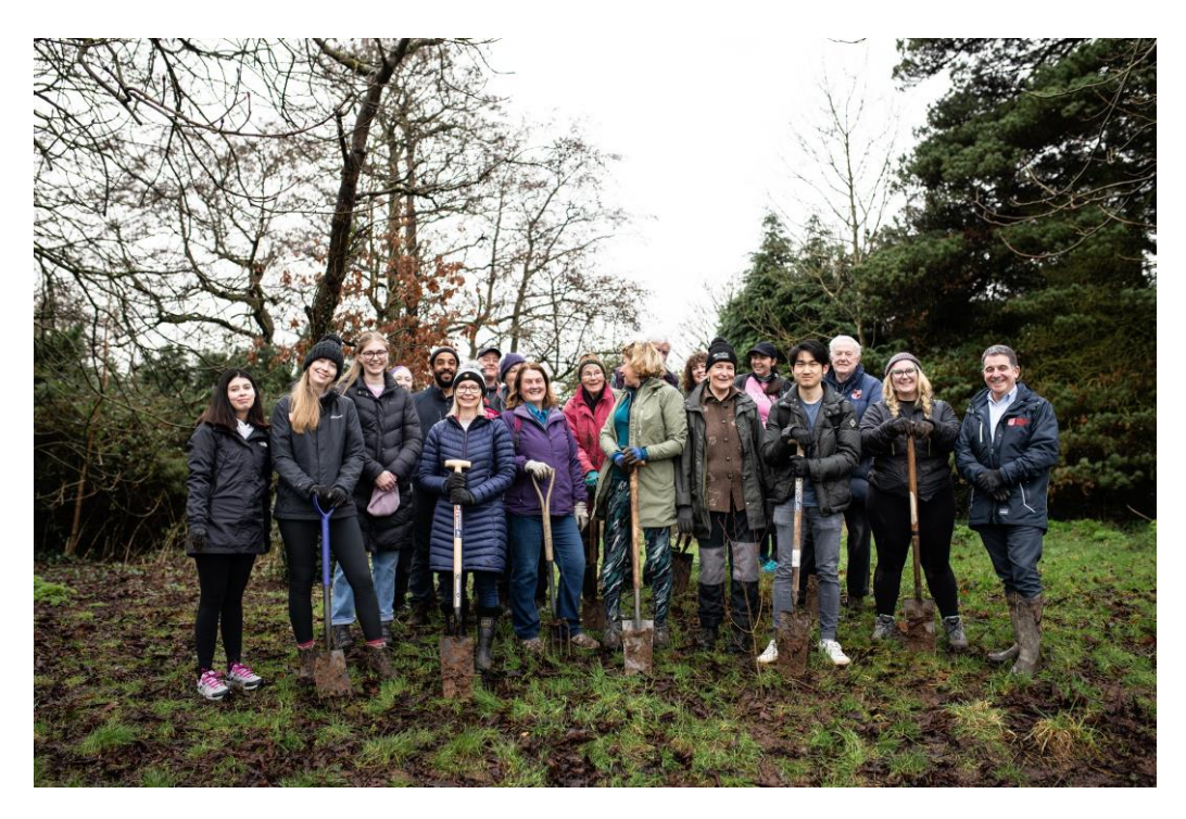
Figure 11: Tree planting at Malone Playing Fields, February 2024.

The University has six 'no mow' areas across campus. Our 'no mow' areas are only cut twice a year (April and September), ensuring our insects are provided with food and a habitat throughout the Spring and Summer period. In April 2024, a new 'no mow' area was established outside our Physical Education Centre, resulting in Queen's having over 7000m<sup>3</sup> of rich biodiversity grassed area. This action was taken as part of our commitment to becoming supporters of the All Ireland Pollinator Plan.