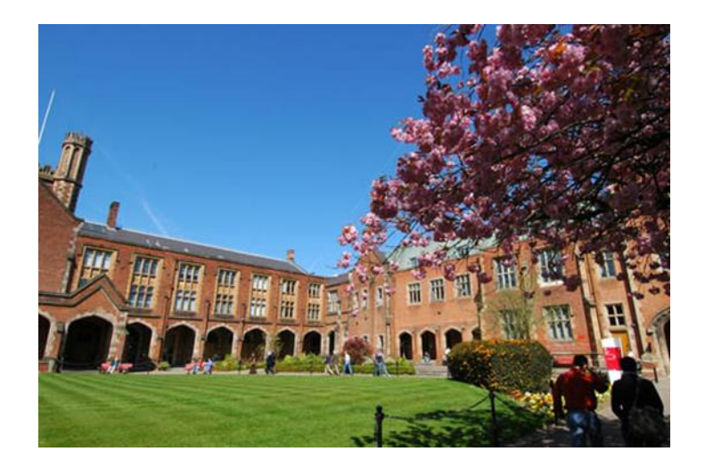
Figure 27. Image of the Quadrangle.

By the early twentieth century, the north and east sides of the quadrangle had been completed in a variety of traditional styles. These buildings were subsequently demolished to make way for the Peter Froggatt Centre and the Administration building. Despite the very modern style of these buildings, their low height and use of red brick tradition maintain the scale and enclosure of the quadrangle.