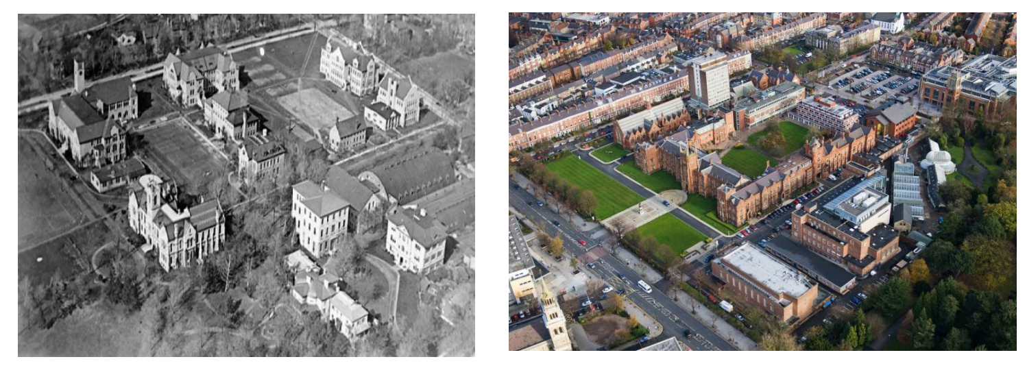
Figure 19 and 20. Aerial image of the Lanyon Main Site in 1919 and in 2017.

Figure 19 provides an aerial photograph of the University in 1919 and Figure 20 provides an aerial photograph of 2017.