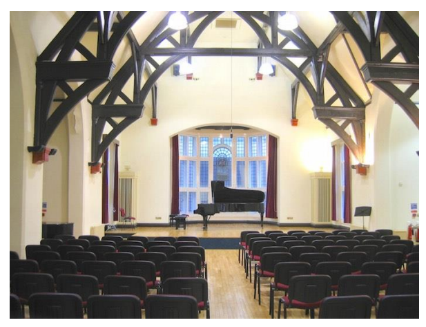
Figure 24. Image of the Harty Room.

It is now used for musical performances and events.