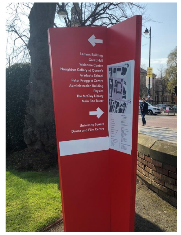
Figure 4. Five information signs are found throughout the Lanyon Main Site.

There are two security gatehouses located at the two main public entrances acting as a welcome and information point for visitors and site users. These are attended by a member of the