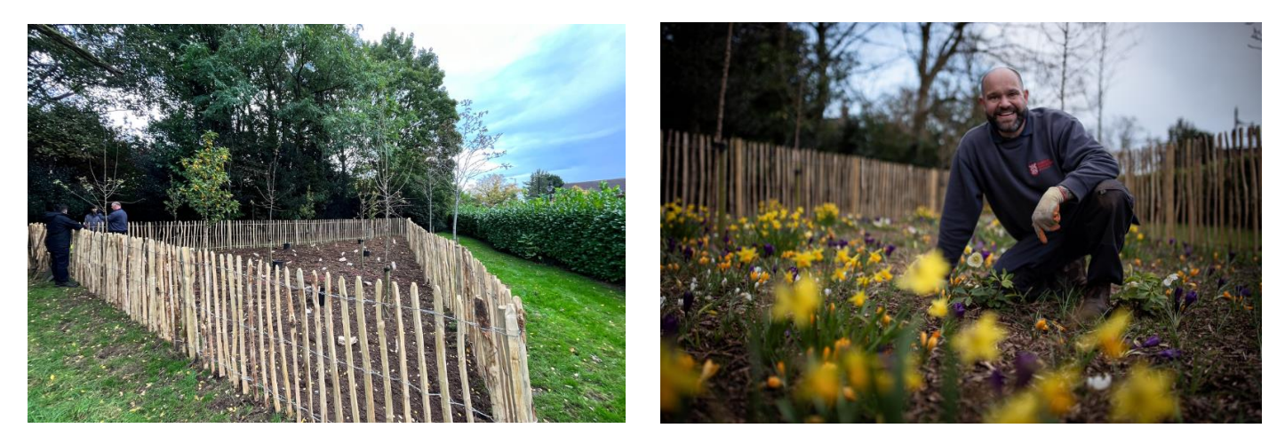
Figure 16 and 17. Bulb planting in Riddel Hall with Queen's Gardener Keith.

community. In October 2023, over 7500 bulbs were planted, including 5000 bulbs planted throughout 7063m<sup>3</sup> of 'No Mow' biodiversity rich grass. Within Malone Playing Fields, a further 146 oak saplings were planted by students, staff and local community members.